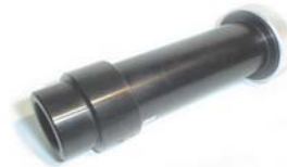
ImSpector OEM version