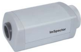
ImSpector cased version

ImSpector can also be combined with multi-channel fibre optics input, which is capable of measuring several points of a target simultaneously. The amount of channels in a fibre optics version can reach up to several dozen.