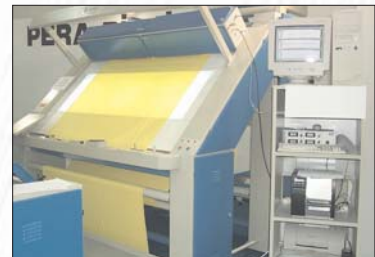
Color control in textile dyeing