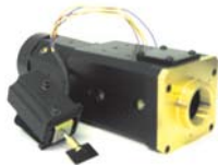
ImSpector Enhanced spectrograph with optional shutter.

The Enhanced series is now available for UV (200-400 nm) and for total SWIR (1000-2400 nm).