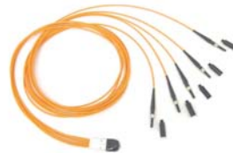
Fibre optic cable with lens