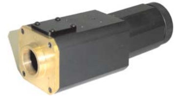
ImSpector Enhanced spectrograph

The Enhanced series meets the requirements when using larger size detectors with more and smaller pixels. These imaging spectrographs are suitable for applications that require high spatial image resolution or simultaneous measurement with large number of optical fibres.