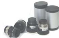
ImSpector Enhanced objective lens, with telecentric image side.