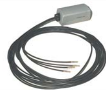
ImSpector with fiber optics